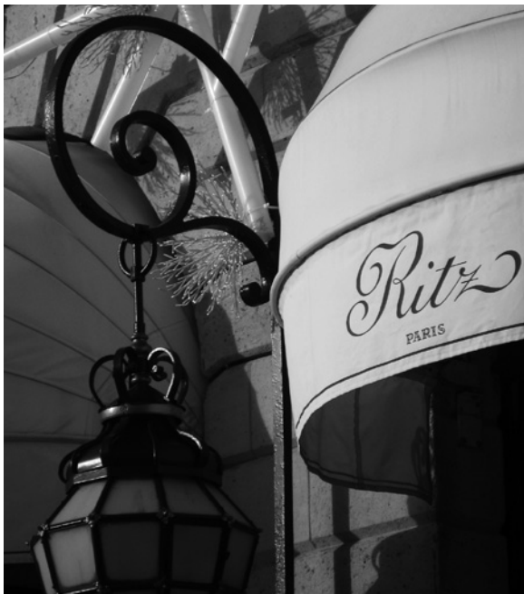
The Ritz Hotel, Paris, an emblem of luxury for over a century

The luxury industry is going through turbulent times. While growth forecasts predict a return to business-as-usual following the financial crisis, there are numerous unprecedented external factors that are impacting the industry. 4 Global communication has, for one, enabled consumers to be more aware of social and environmental issues. The explosion of social media is changing the role of advertising and branding. The shift from the West to the rest has likewise matured sufficiently so that emerging cultural ideas and icons from around the world are complimenting the well-established cultural assumptions that have guided the luxury industry until now.