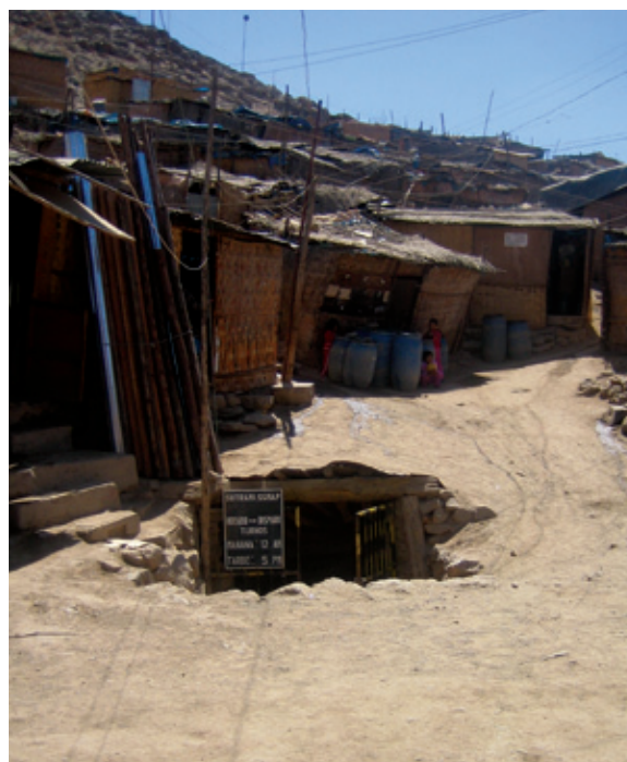
Responsible artisanal gold mine, Santa Filomena, Ayacucho, Peru

Fairtrade Fairmined gold was officially launched in February 2011. Fairtrade Fairmined gold is a certain guarantee for companies that decent work and community development is coming from gold mining. Seek to buy an increasing amount of Fairtrade Fairmined gold as part of a broader approach to ethical sourcing. Determine whether and how to communicate the use of Fairtrade gold to key stakeholders, including staff, investors, media, celebrity endorsers and consumers. Do not let potential questions about a limited percentage of gold sold coming from Fairtrade sources to lead to inaction, but clarify your communications strategy and seek understanding from key NGOs and journalists.