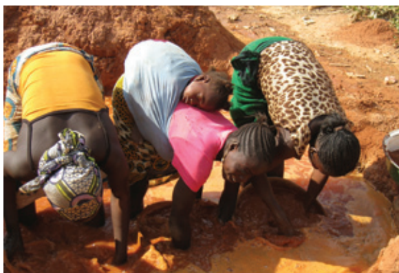
Women washing gold ore, Kangaba, Mali

In light of the requirement to complete certification by end-2011 to retain membership with RJC, the industry initiative will oblige better management of social and environmental issues, and create a new industry standard. While company processes will be formalised, this does not necessarily mean that brands will be creating a positive impact on the ground. This limitation is addressed below in the chapter 'Unveiling Ethical Excellence.'