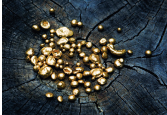
Nuggets of gold

Concerns over the ethical sourcing of gemstones and precious metals since the mid 1990s has generated interest in the ethical performance of jewellery brands. Initiatives that attempt to promote a responsible jewellery industry exist, but questions over their limitations and the availability of information on social