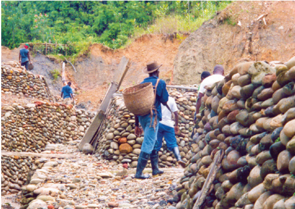
Responsible gold mining, Americo's mine, Chocó, Colombia