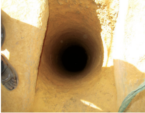
Kangaba-Mali access hole to the underground shafts

what experts considered leading practice to determine if brands' corporate responsibility were aligned. The study found that, of the leading luxury jewellery brands analysed, it appears that most are not systematically addressing the ethical, social and environmental aspects of their business throughout the supply chain. The research suggests that key failings include an inadequate focus on traceability and pro-poor development issues, insufficient transparency, the emphasis on safety rather than opportunity, and limited attention to relationships. The report finds various levels of corporate responsibility engagement. Boucheron and Cartier were found to be working on social and environmental issues in a significant way, while Bulgari, Buccellati, Chanel, Chopard, Graff, Harry Winston, Piaget and Van Cleef & Arpels were found to be either inactive or partially active on these issues.