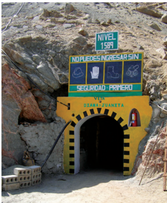
Responsible artisanal gold mine, Cuatro Horas, Arequipa, Peru

Two other areas were mentioned as well, namely, the training of miners with respect to chemical usage, and the human development of workers, particularly miners.