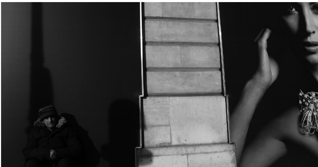
Contrasts, Place Vendôme, Paris, January 2011

What this means for the luxury sector, including luxury jewellery, is that brands need to demonstrate not only excellence in terms of social and environmental performance through their strategies, but their