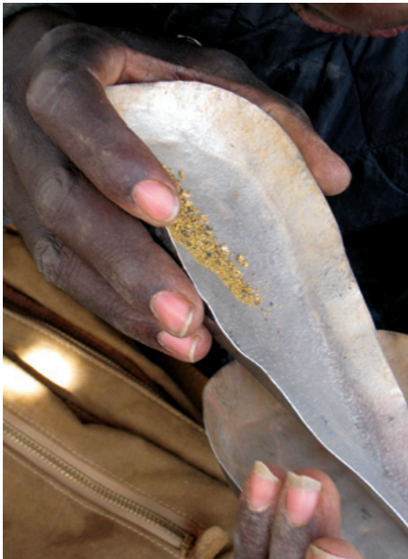
Future design inspiration?

The very design of the jewellery itself has the potential to embed the story of mine to market so there is the opportunity for brands to reflect on what designs or metaphors could be the expression of an ethically sourced piece.