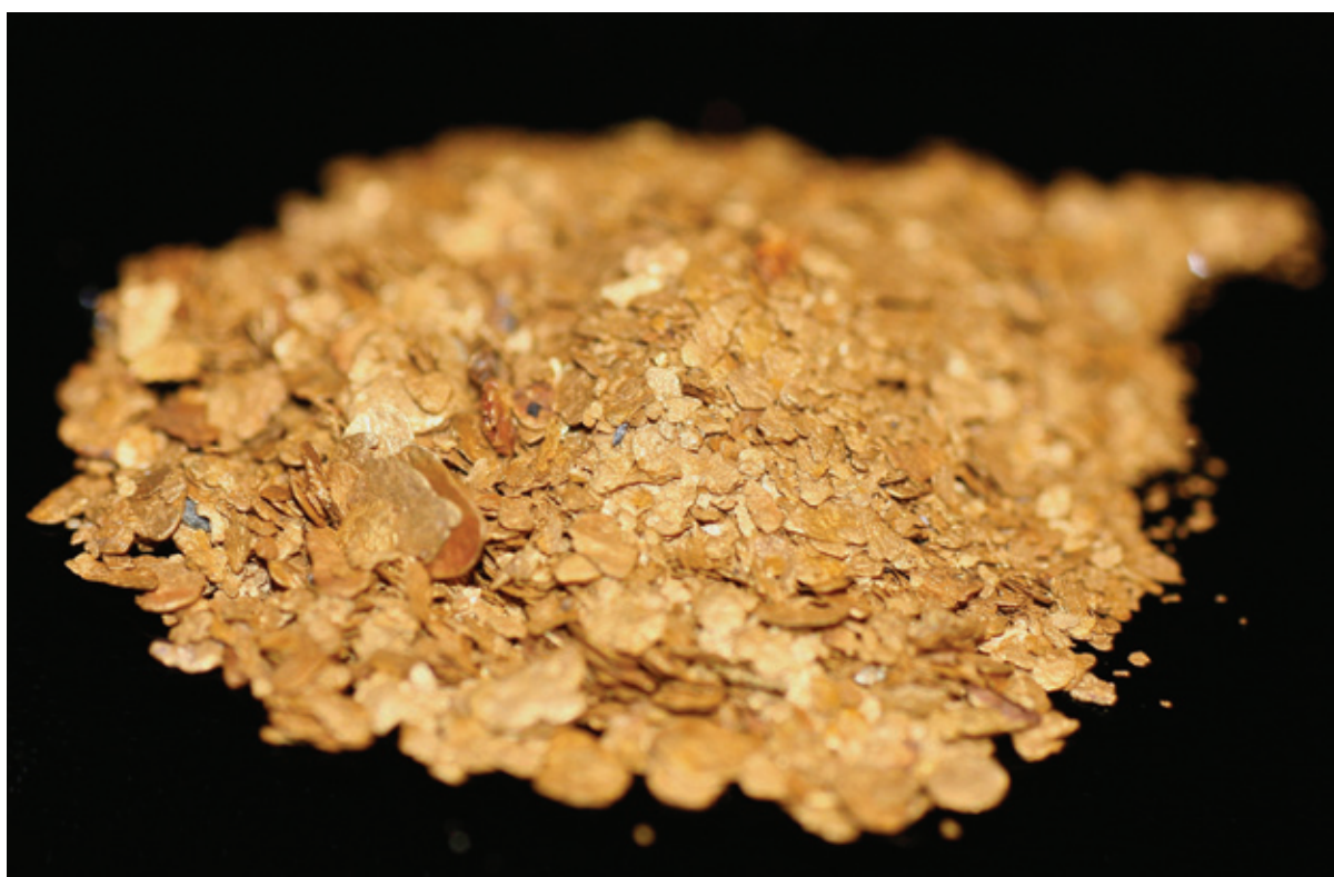
Fairtrade Fairmined Ecological gold from OroVerde in its raw alluvial state pre refining

In regards to diamonds and gemstones, CRED Jewellery guarantees the origin of its material as does Oria, by partnering with specific mines in Australia,