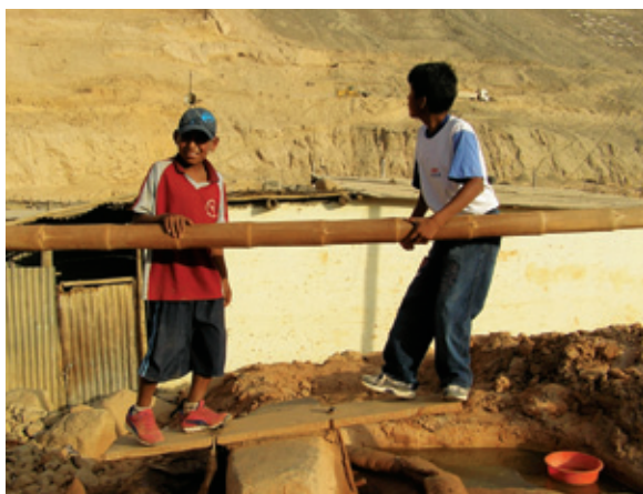
Quimbelete Pits Peru, used for amalgamating gold to mercury.

How effectively the RJC certification assures supply chain integrity will be critical for luxury jewellery brands. What is clear is that more will have to be done. In a 2009