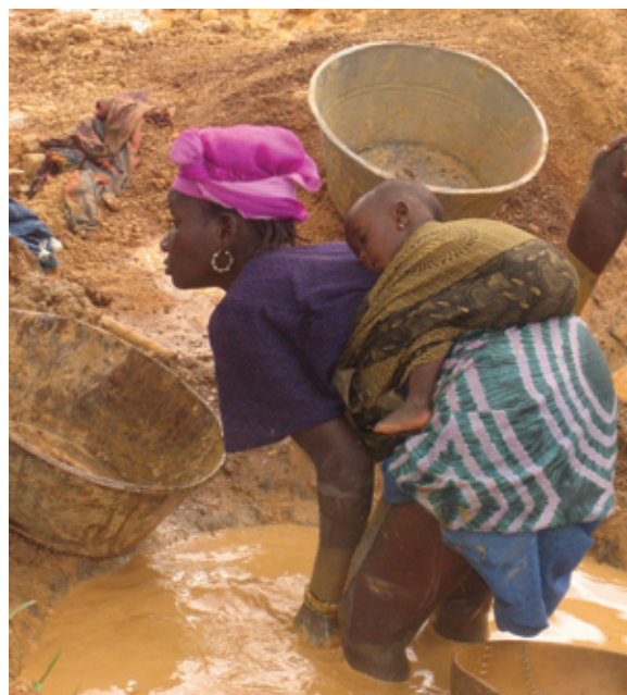
Kouroussa, Guinea-Conakry, woman washing gold ore

Occupational health and safety referred specifically to the appropriate use of chemicals in mining. But it also requires oxidising agents during manufacturing, and appropriate ventilation and protective equipment. One expert recommended that fabrication should take place in owned workshops, with audited subcontractors, and where working conditions and health and safety standards meet Western levels.